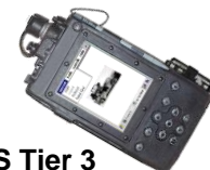
EKMS Tier 3