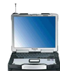
Mission Planning Support Client